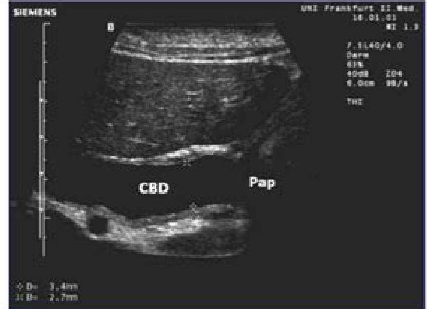
More or less symmetrical thickening of bile duct walls